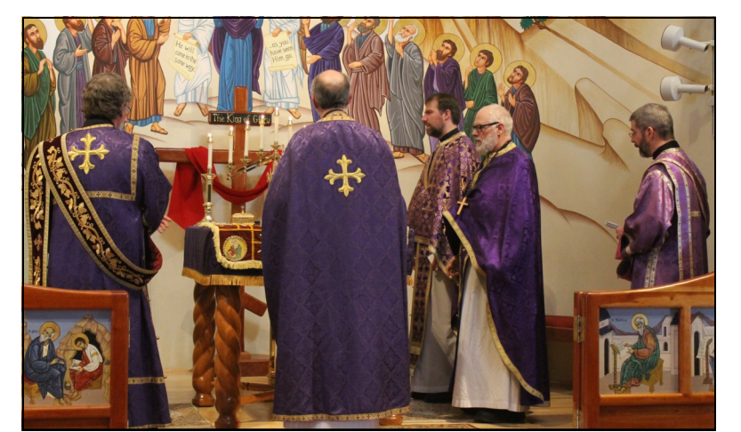
The vestments of Lenten purple. . .