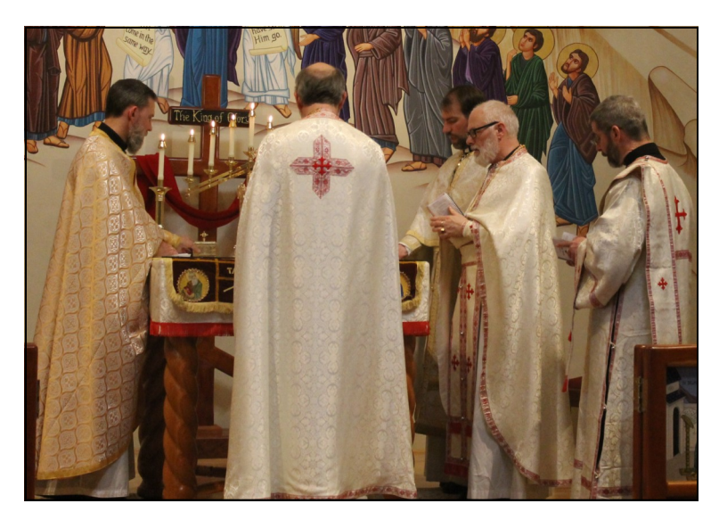
turn to joyous Paschal white.