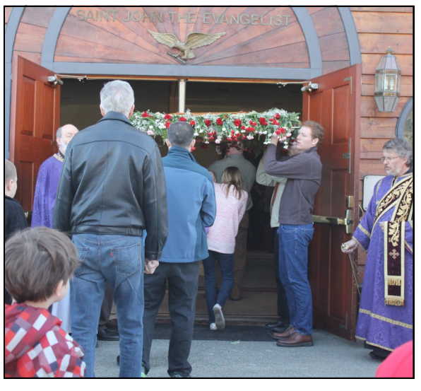
We take turns going under the bier and dying with Christ.